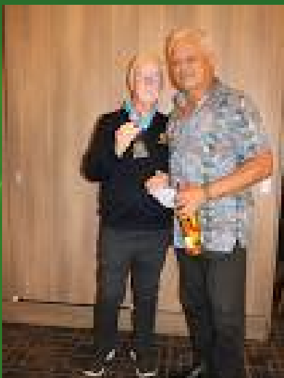
B Grade Champions

I would like to thank the committee and members for my Life Membership presentation thank you all.