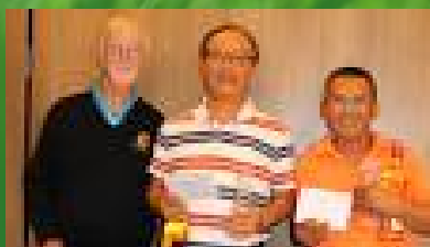
Joint A Grade Champions